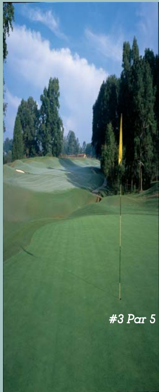
#3 Par 5