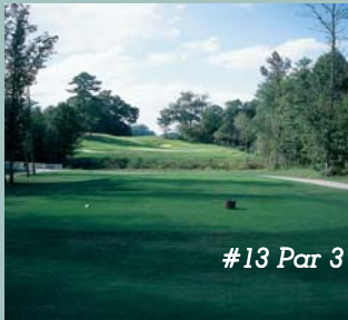
#13 Par 3

Manicured Crenshaw Bentgrass Greens and Bermuda Fairways complete the quality golf experience, but it's not just the pleasant surroundings at Creekside that capture your attention, it's the demands that have been extracted from the Georgia Countryside that will make you sit up and take notice. Come enjoy a test of golf that is truly what the game is about.