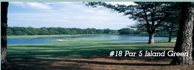
#18 Par 5 Island Green